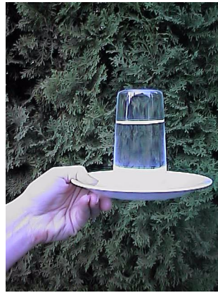
Don't Get Wet!