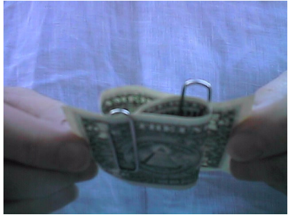
Paper Clip Link-Up