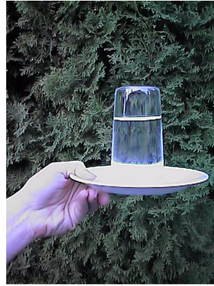
Don't Get Wet!